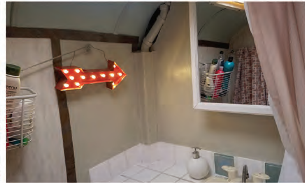
1966 FORD ECONOLINE SUPERVAN