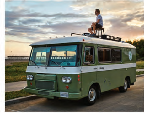
1966 CLARK CORTEZ