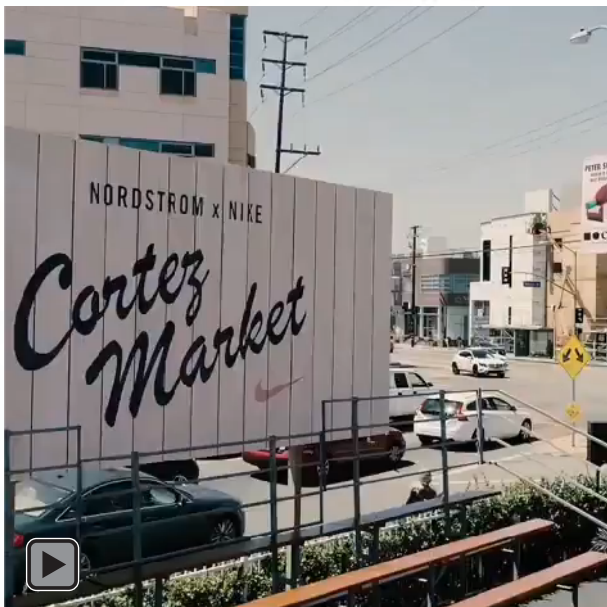
NIKE x NORDSTROM SHOE RELEASE (MOVIE)

Epoch Restorations and Adventures (ERA) specializes in finding and restoring vintage camper vans that speak to people. We truly believe that vintage is timeless, and timeless products never go out of style. We've had the privilege and fortune of working with some of the biggest brands in clothing, photography, music and many other leading industries. Whether it's a pop-up coffee shop for a private event, or a product release for a fortune 500 company, we have the ability to create curated experiences for various clients. Please consider Epoch for your next photo/film shoot, private event, product release, Music Festival or as a unique mobile hospitality option. Transform your marketing and events into a new ERA!